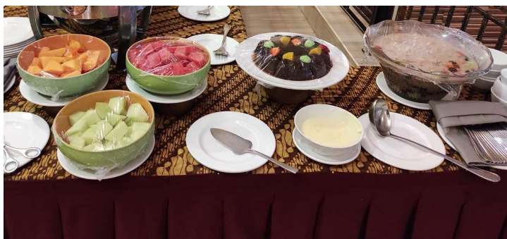
Figure 4. Standard Set Up Event