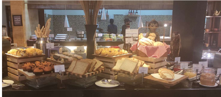
Figure 2. Standard Set Up Breakfast

a rolling set up breakfast every 2 months. The standard bread that must be in breakfast is: white toast, brown toast, softroll, french bread, muffins, donuts, various sweet breads, various jams