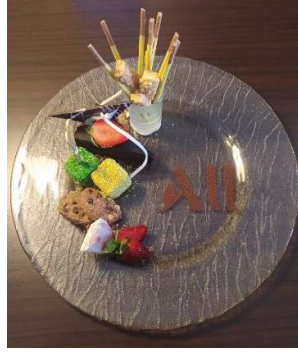
Figure 5. Compliment Cake

After that, if indeed it is a mistake from the Pastry Section, a Chef de Partie will convey an apology to the guest and give a complimentary cake. Then if there are guests who complain about the length of time for food delivery but have been informed in advance that the food will take longer than usual, the Food and Beverage Service will convey the apology directly to the guest.